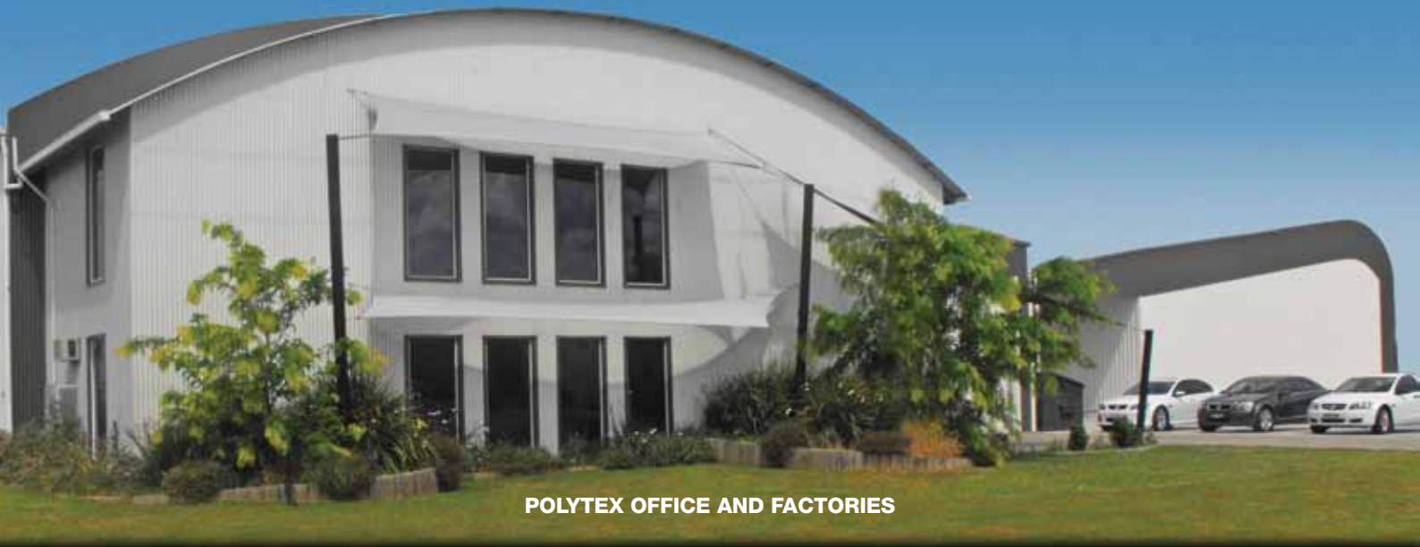
POLYTEX OFFICE AND FACTORIES